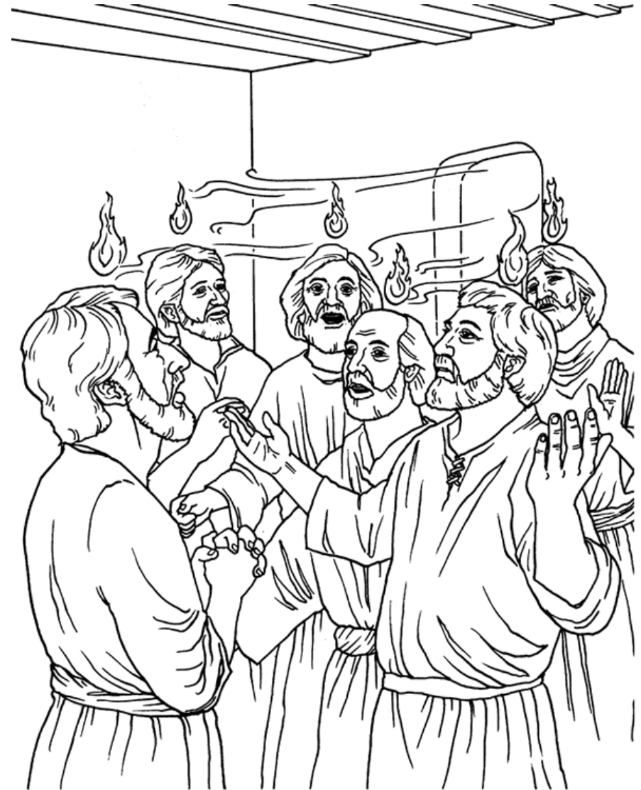
The Day of Pentecost Acts 2